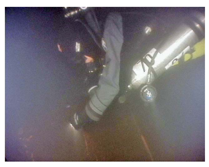
SCRET Diver Peo Orvendal inspects canopy