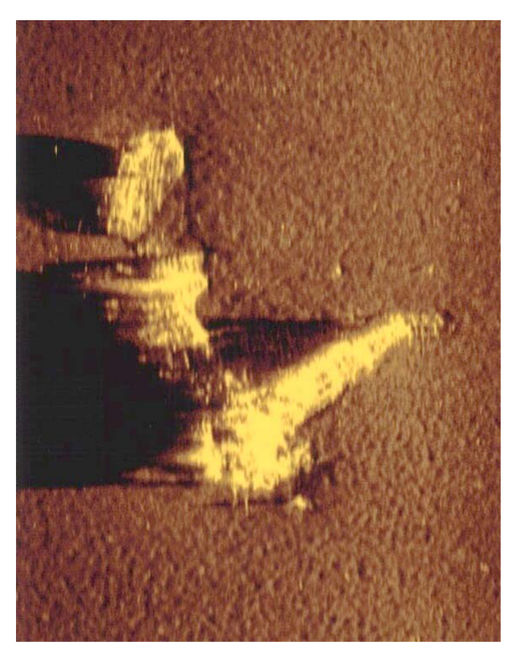
Side scan Image of Wildcat