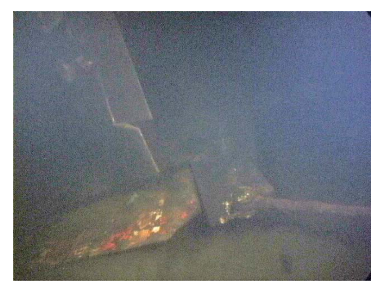
Tail (Rear View)