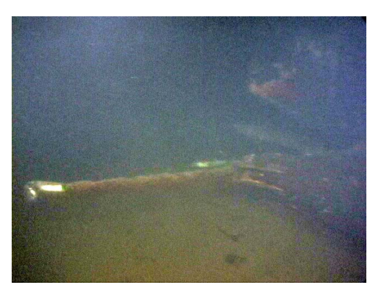
Tail Hook for Landing on Aircraft Carriers