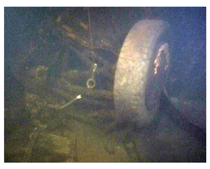
Main Starboard Landing Gear