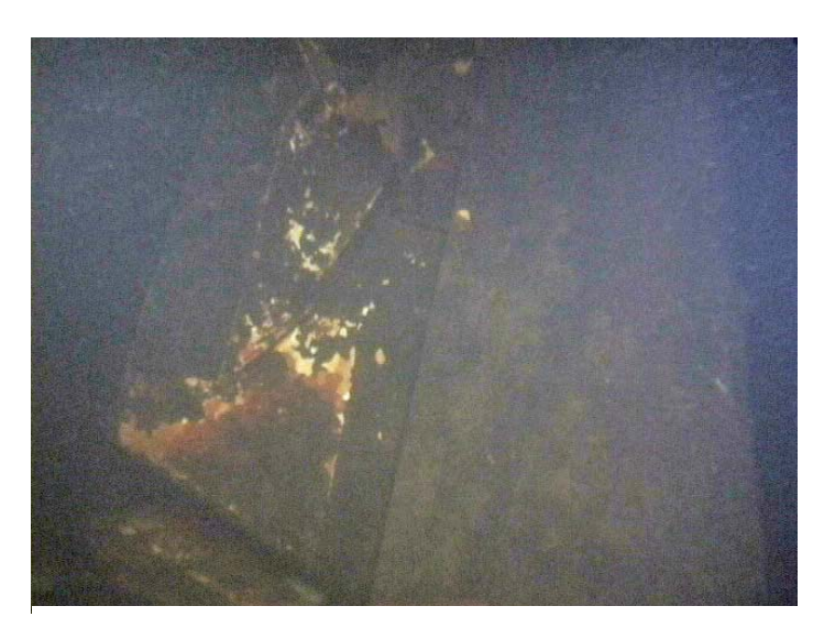
Tail (Side View)