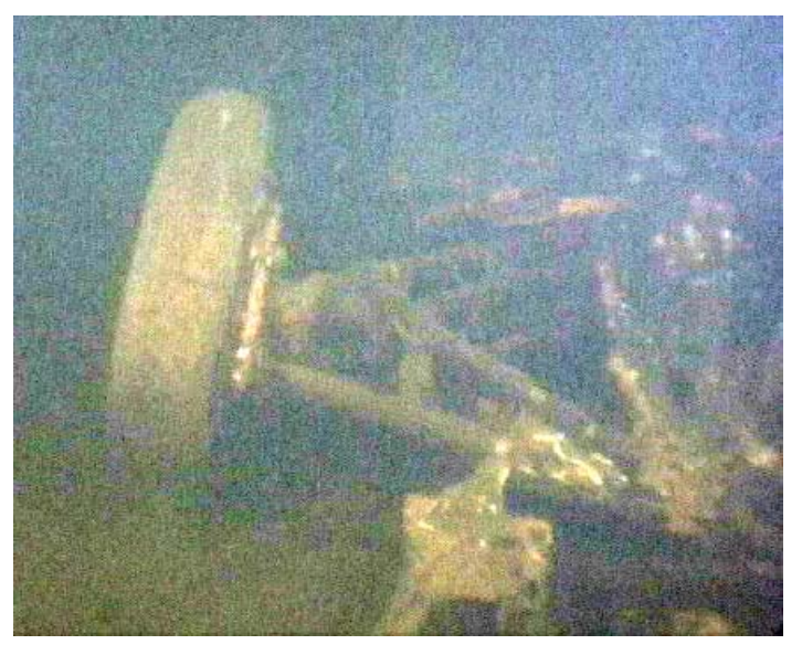
Main Port Landing Gear